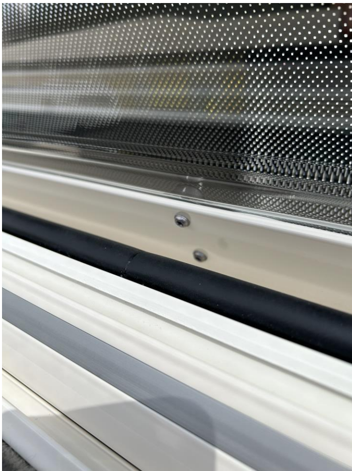
Figure 2 - Example of unsecured lower screw fixing with a loosened (lower) screw